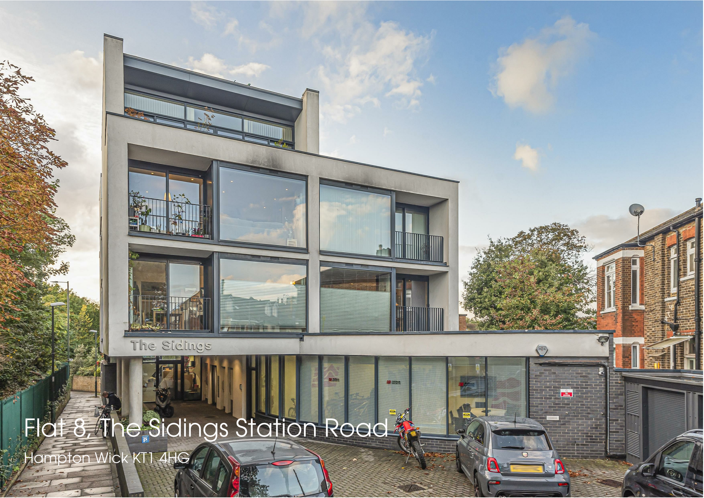
Flat 8, The Sidings Station Road Hampton Wick KT1 4HG